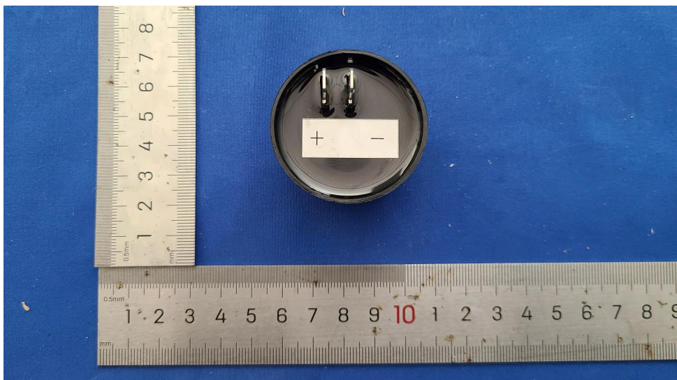
Photo 2 General Appearance of the EUT

This report shall not be altered, increased or deleted. The results shown in this test report refer only to the sample(s) tested. Without written approval of BST, this test report shall not be copied except in full and published as advertisement. BST Physical & Chemical Lab.