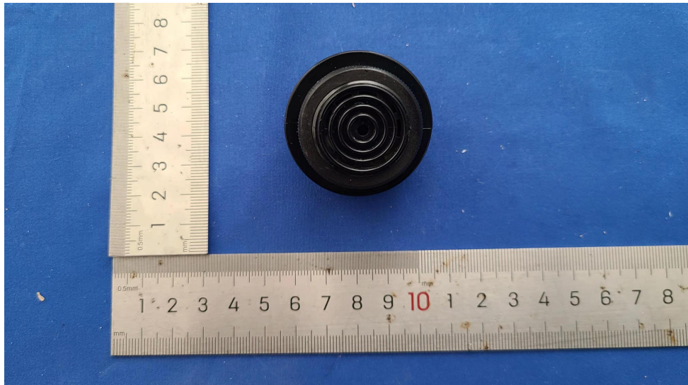
Photo 1 General Appearance of the EUT